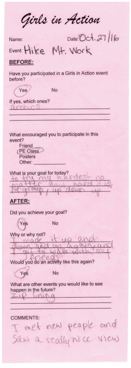
Figure 3. Evaluation form

and outdoor activities: hiking, Bellyfit, tai chi (in a park) and aerobics. Each of the four events was well attended by 60 to 80 girls with various ability levels and from different backgrounds. Of the 174 adolescent female participants, seven were First Nations students, five were special-education low-incidence students, and six were living with mental health or behaviorlearning challenges.